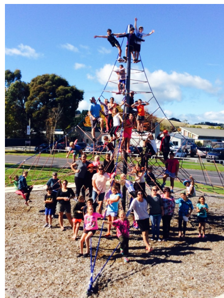
STUDENTS AND PARENT HELPERS -TURANGI