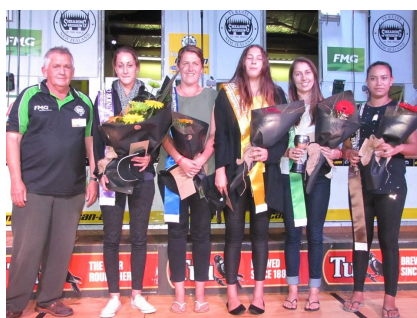
FINALISTS JUNIOR WOOLHANDLING SECTION